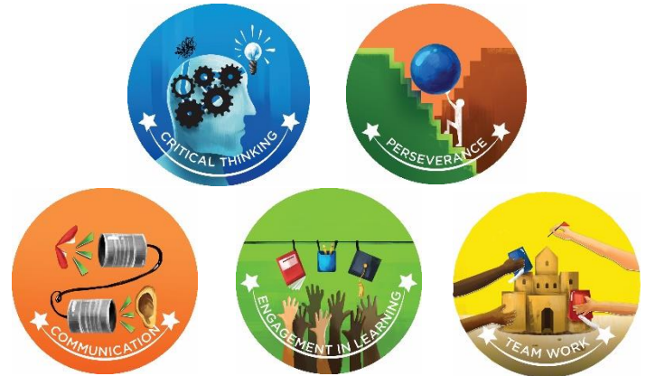
Badge logos and pins designed by Artists for Humanity

Each program used a physical object to represent the badge(s) that they awarded to students. In 2015, Boston Beyond made 1 ½" button pins bearing the logo for each badge, which programs awarded to their badge earners during their award ceremonies. Program staff were "pleasantly surprised" that students were excited about the badge pins. "When [students] get [badges]...they can remember...I know what this means and now I have a little piece of it. I have a physical manifestation [of my skills] in this badge."